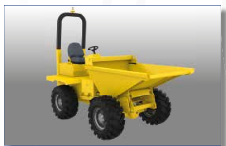
Powered wheelbarrow and mini dumper